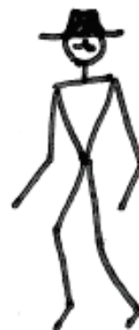
He is a man.