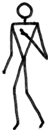
He is a man.