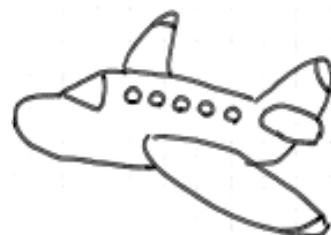
It is an airplane.