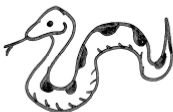
It is a snake.

順番に絵を見て文章を読んでいくことによって、「Its」の意味・使い方がわかります。