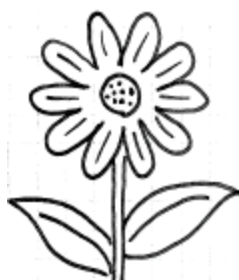
It is a flower.