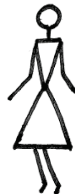
She is a woman.