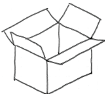
It is a box.