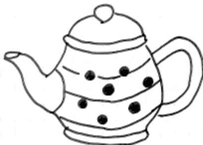
It is a kettle.